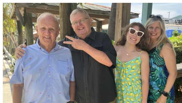
Some fun fellowship and a tasty lunch at the Swordfish Grill we were enjoyed by members of our church family.