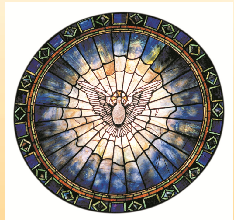
Holy Spirit Dove Window (Louis Comfort Tiffany) First Presbyterian Church, Springfield, Illinois